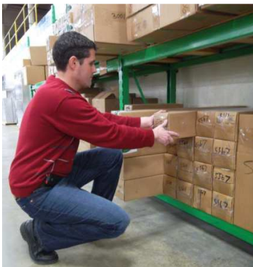
Pulling Your Order from Stock