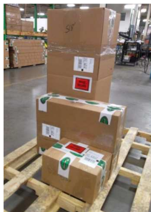
Boxes Prepared for UPS