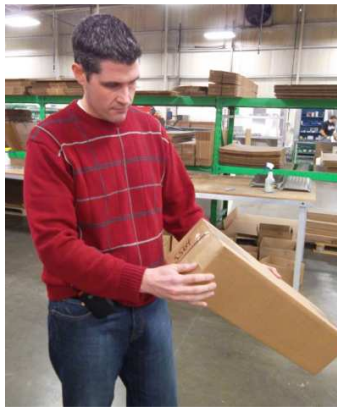
Carefully Inspect the Box