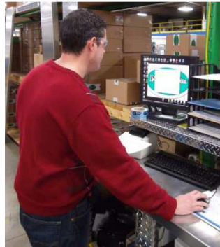
Entering Your Order